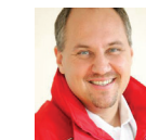
Gerry Foitik, Federal Emergency Commander, Red Cross, Austria

"THE DIFFERENT POSSIBILITIES OF FUNDING SOCIAL BUSINESS I HAVE LEARNED ABOUT IN THE PROGRAM HAVE SHOWN ME THE IMPORTANCE OF THE PHILANTHROPIC SECTOR. WE NEED TO DEAL WITH IMPACT MEASUREMENT. IT WILL IN A FIRST STEP BE A GOVERNANCE TOOL BUT IN FUTURE BECOME RELEVANT TO OPEN UP NEW FUNDING SOURCES ."