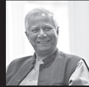
MUHAMMAD YUNUS Nobel Laureate and Founder of the Grameen Bank

Making autism an advantage for the labour market. The idea has since found its way to major companies’ board-rooms around the world.